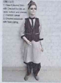
STD. IX ONWARDS