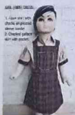
NURSERY TO U.K.G.